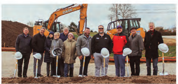
Breaking ground in West Norriton for the Community Banquet Hall.