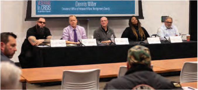
Speaking with Veterans at my Veterans in Crisis Town Hall.