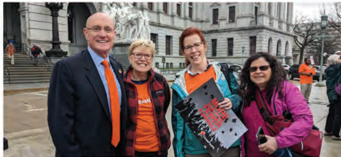
Advocating for gun reform in Harrisburg with members of our community.